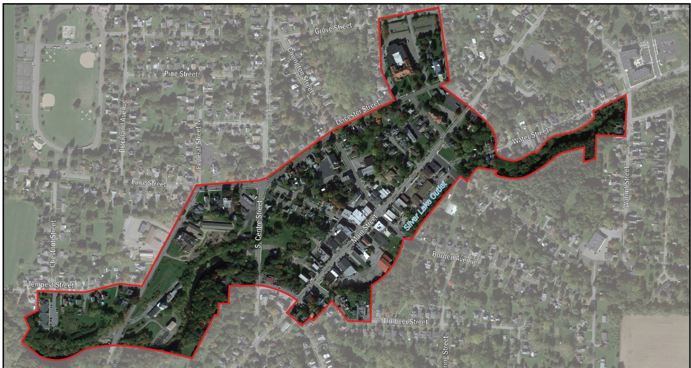
Village of Perry DRI Boundary

If your project does not meet all of the criteria described in this section, we still want to hear your project idea! Please share your ideas at www.villageofperrydri.com .