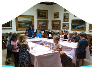
Most Attended Program: Children

Salary & Benefits: $154,054 Operation & Maintenance: $32,348 Miscellaneous: $33,070 (Supplies, programs, technology, etc.) Collections: $12,265 Rollover to 2023 Building: $6,300 Move to Reserves: $3,873 Total: $241,910