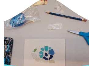
Most Attended Program: Adult