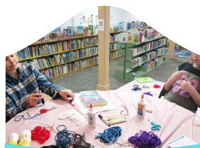
Most Attended Program: Teen